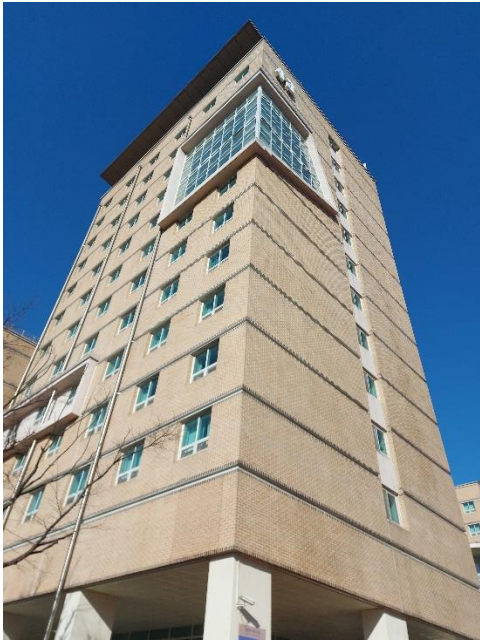
The international dormitory.