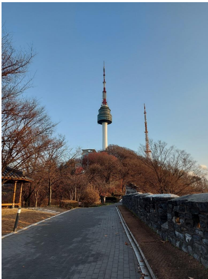
Namsan Tower in the middle of Seoul.