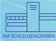
AM SCHLEUSENGRABEN 24

Not far from our headquarters at Steindamm, our wind team is researching, among other things, how the rapid expansion of wind energy in Germany – both onshore and offshore – can enable wind turbines to make an ever-greater contribution to security of supply.