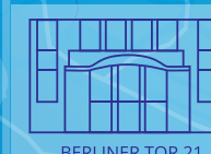
BERLINER TOR 21

The Steindamm site is home to the project management of the major projects, the business development department, the strategic planning department and the CC4E management with central functions. From here, a total of around 30 ongoing projects with a total of around 80 employees are managed.