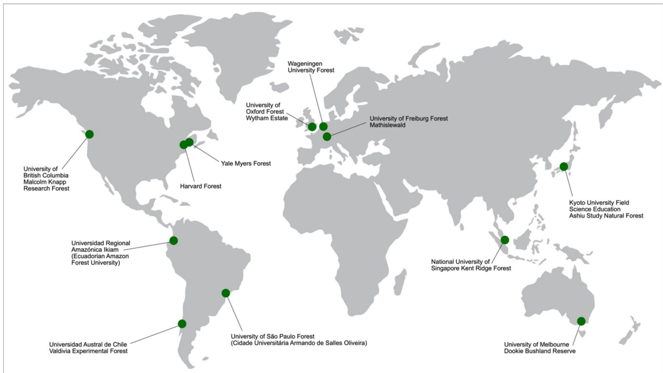
Fig. 1 Global sample of selected university forests (not to scale)