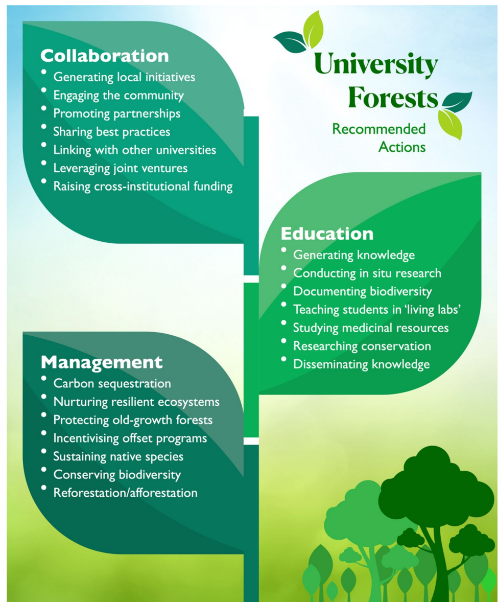
Fig. 2 Schematic representation of the recommended measures universities may deploy to leverage the benefits of their forested landscapes (concept by authors)